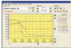
Real Time Recording